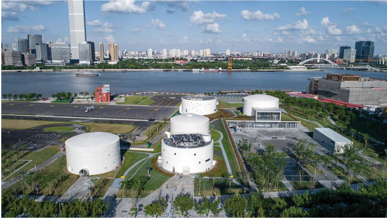
TANK Shanghai, 2380 Longteng Avenue, Shanghai, China. February 3, 2023